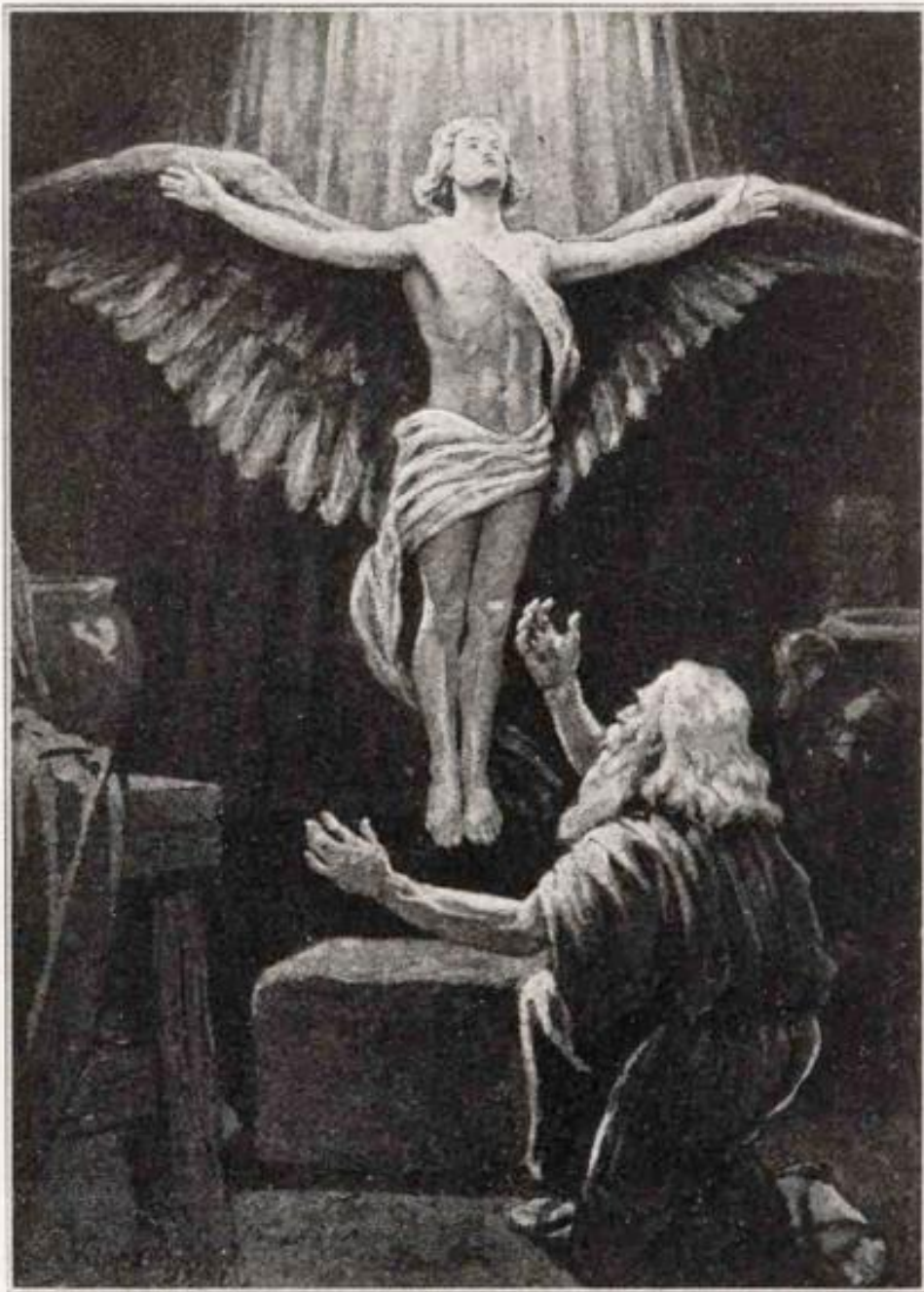
With a spring upward and a spreading of its mighty pinions, the new-born God soared heavenward to the heart of the Great Light, a wondrous flutter of crimson robes.